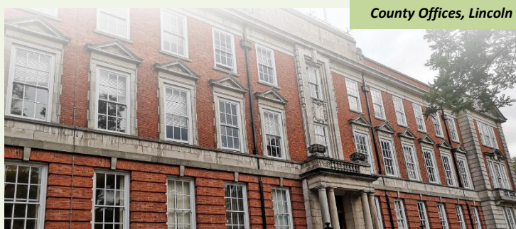
County Offices, Lincoln

reflected the diverse nature of Lincolnshire's communities, and new graphics were subsequently requested based on this feedback for including in the strategy.