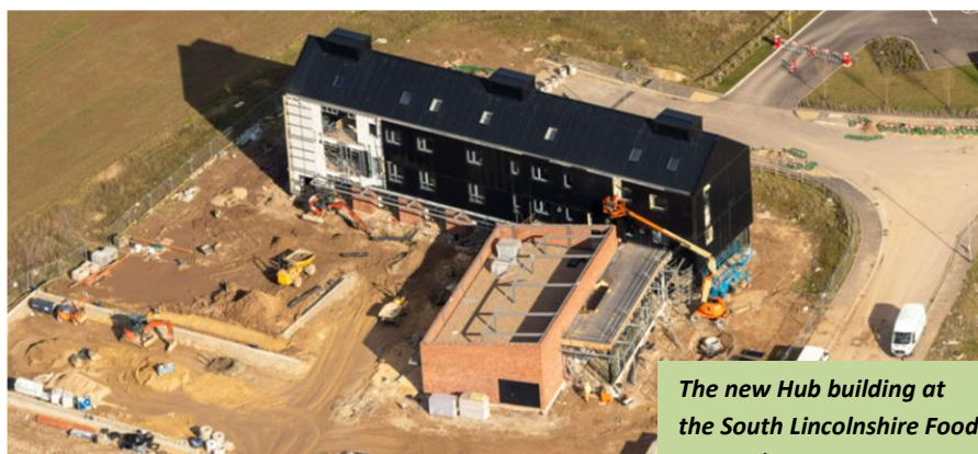
The new Hub building at the South Lincolnshire Food Enterprise Zone

Committee unanimously supported the construction of a managed workspace building on the council owned Plot 12 of the South Lincolnshire food enterprise zone and hoped that the new development would encourage greater use of the port of Boston stimulating further business and economic activity in that area as well.