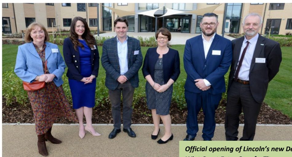
Official opening of Lincoln's new De Wint Court Extra Care facility

In March 2022, De Wint Court in Lincoln, which was approved in July 2019, was opened, providing 50 one-bedroom and 20 two-bedroom apartments. In this case the county's partners are the City of Lincoln Council and Homes England. De Wint Court has a wellbeing