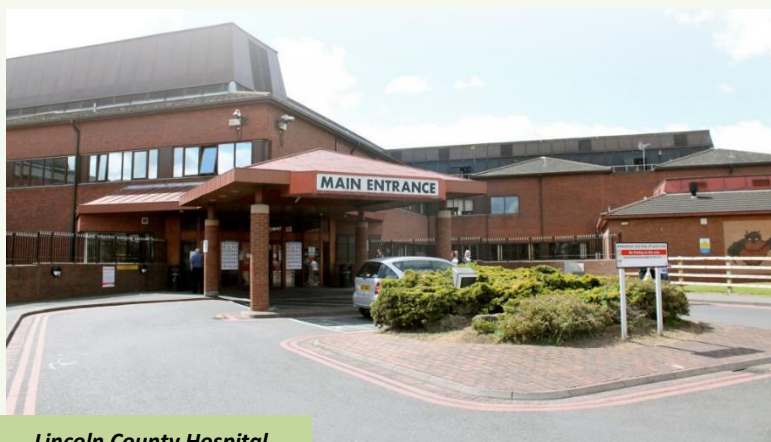
Lincoln County Hospital

All four proposals, part of the Lincolnshire acute services review, were considered by the committee between October and December 2021 and by a working group in January 2022. The committee accepted the arguments in the pre-consultation business case on the need for change in each case and the committee also supported proposal (1). However, the committee was not convinced that proposals (2), (3) and (4) were right for the people of Lincolnshire. The reasons for the committee's conclusions included concerns on travel and transport; the recruitment and retention of staff; and impacts on neighbouring health systems.