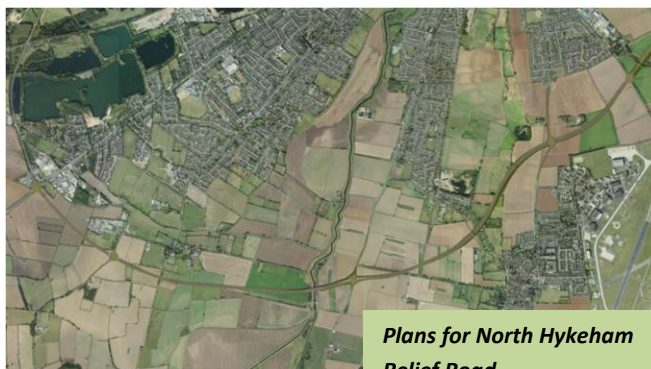
Plans for North Hykeham Relief Road

The ring road comprises four sections of carriageway: the Lincoln Western Relief